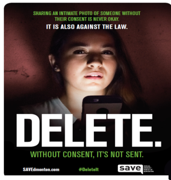
Flyers created and developed by the SAVE committee