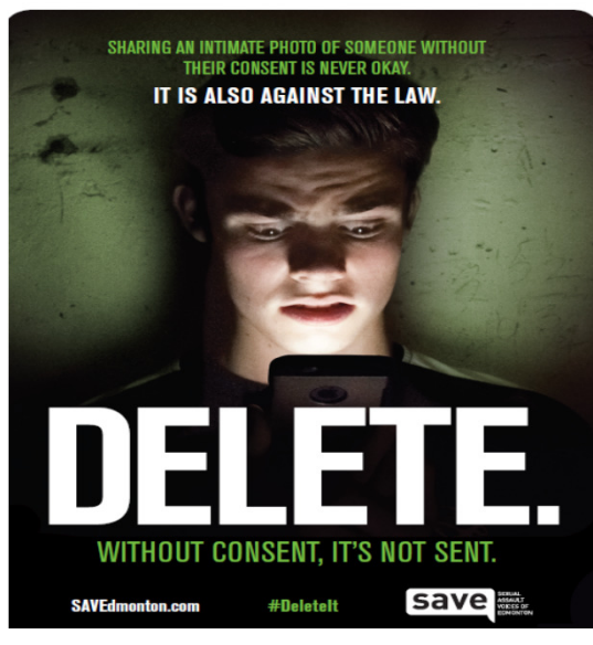
Flyers created and developed by the SAVE committee

Teach children that no one should touch their private areas except for a medical professional in the presence of a parent. Children should know that if anyone touches them inappropriately they should try to get out of the situation, seek help and tell an adult. Talk to children individually at least once a week and address any changes of behavior which may indicate the child is struggling with an issue.